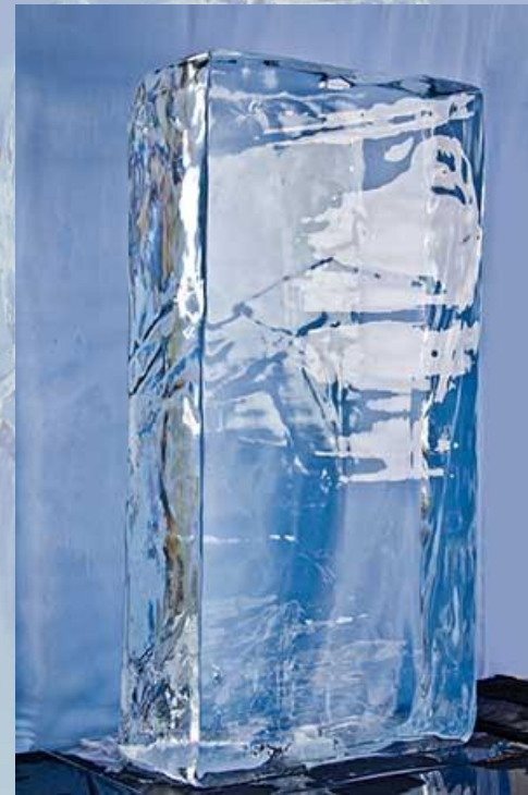
Ice Carving Blocks