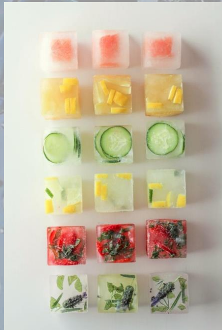
Fruits Inside Ice cubes