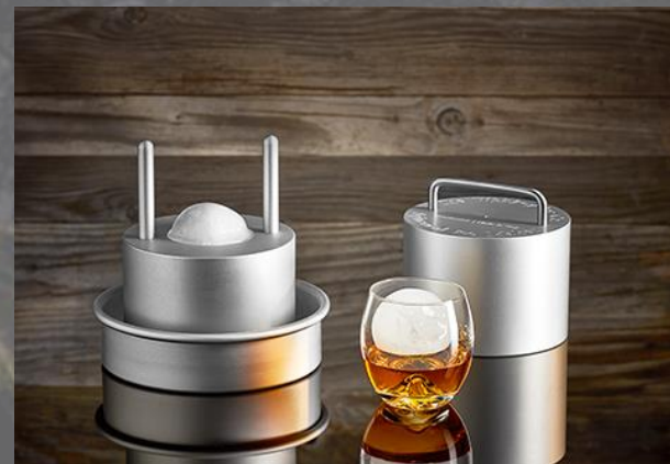
Ice ball maker