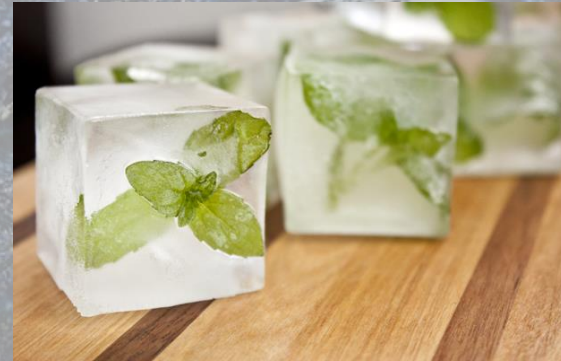
Minted Ice cubes