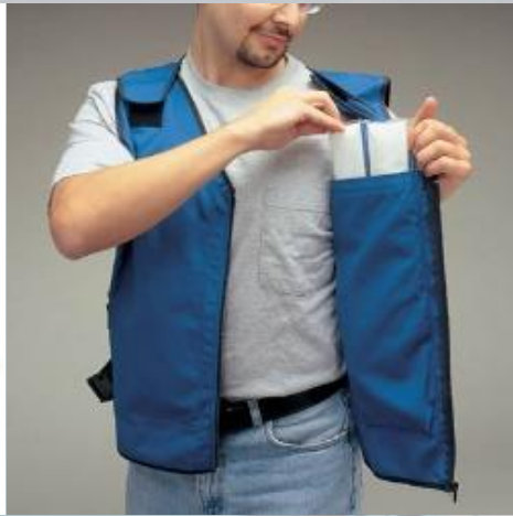
Gel Ice Jacket