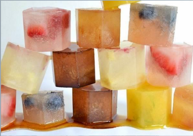
Flavored Ice Cubes