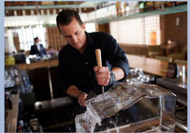
Ice Blocks for Bars