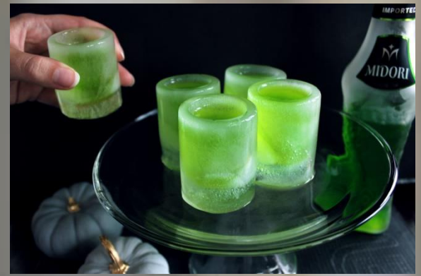
Ice Shot Glasses