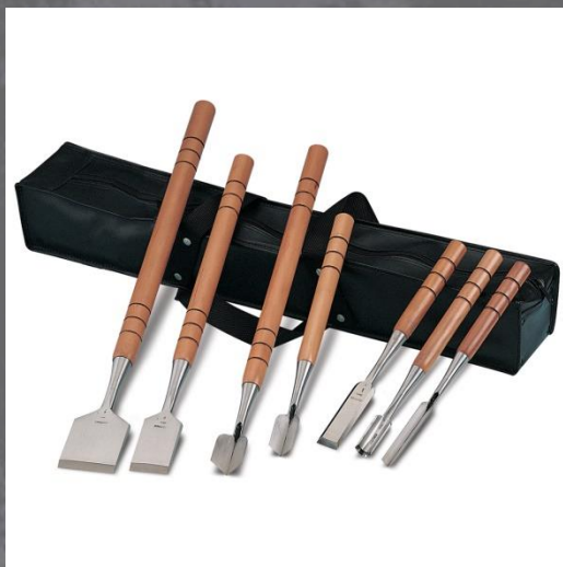
Ice carving tools