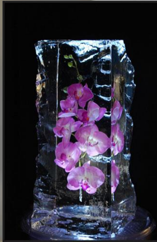
Elegant Ice Creations