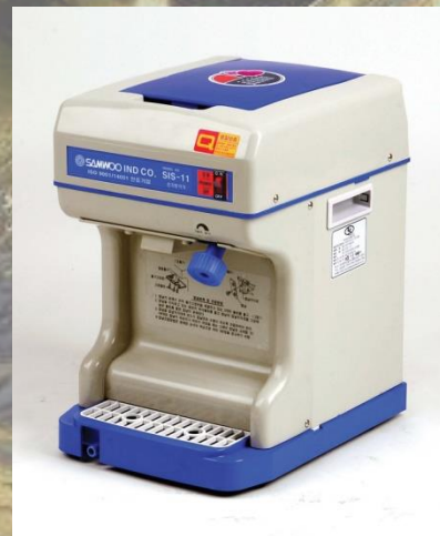
Ice Shavers and Crushers