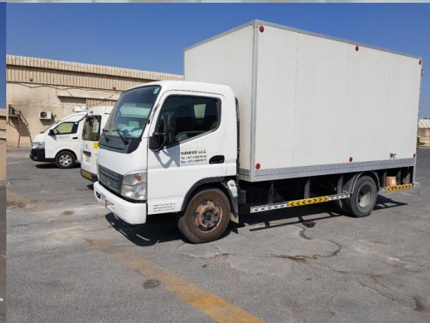
Freezer Vans and Trucks for rent