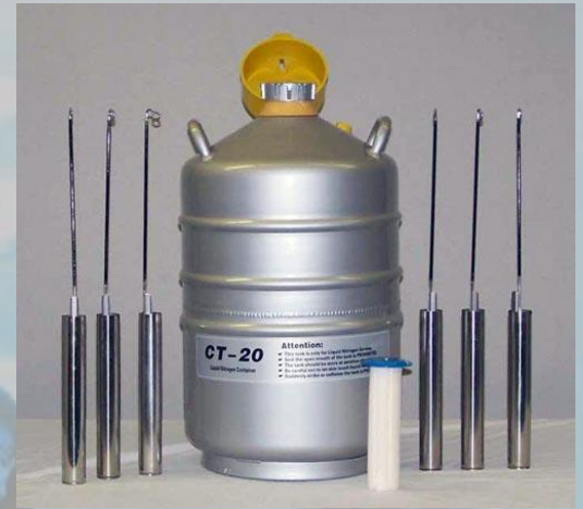
Liquid nitrogen containers